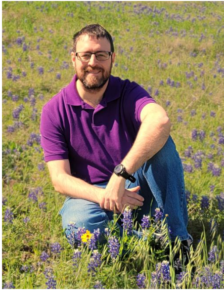
A Texan's traditional spring bluebonnet picture. I hadn't taken one in years.