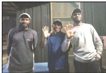
Kanite men waving goodbye after recording their voices for the sorcery movie.