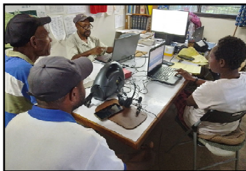
Fore language team members finishing final NT audio editing in early May.

👉 PTL—for the translated Bible verses completed, and that the Kanite language sorcery reconciliation movie is finished!