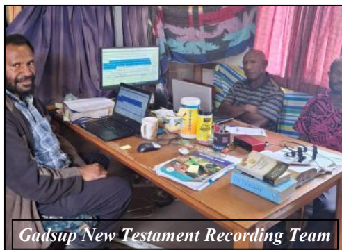
Gadsup New Testament Recording Team