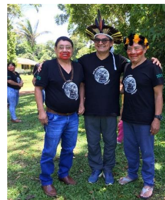
A couple other Cinta Larga translators dressed in traditional regalia.

Click here to view a video about oral translation highlighting the Cinta Larga people.