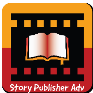
oral story translation app to publish Bible videos

to prayer -- all the people from all over the world that He has brought along to cross paths as partners in this endeavor. Jesus does not send us out alone to share his message with the world. He goes with us and helps us.